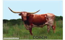
ACE'S ZOLA ROSE